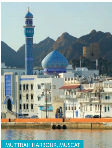
MUTTRAH HARBOUR, MUSCAT