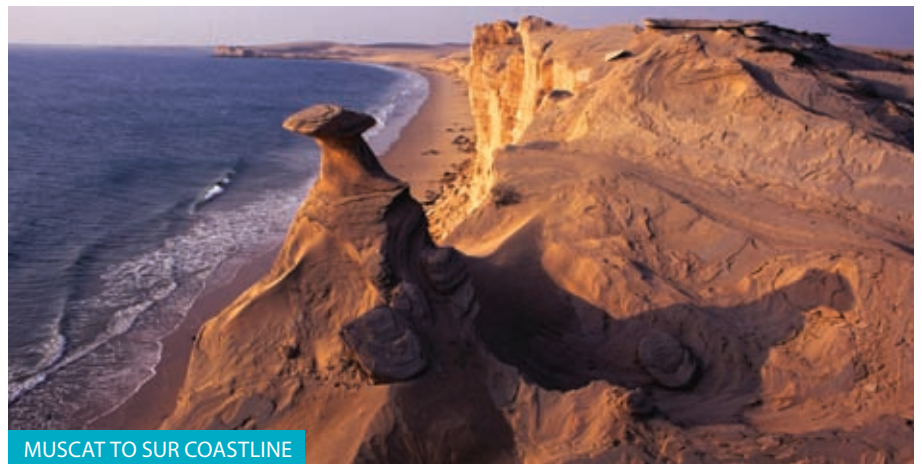
MUSCAT TO SUR COASTLINE