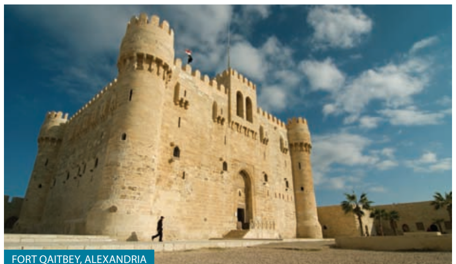
FORT QAITBEY, ALEXANDRIA

Entrance to the Mosque on Temple Mount not included. Bethlehem and Jericho are under the Palestinian Authority Jurisdiction and therefore the visit is subject to confirmation on the day. Rates are "from" prices and therefore only a guide. Supplement applies depending on seasonality.