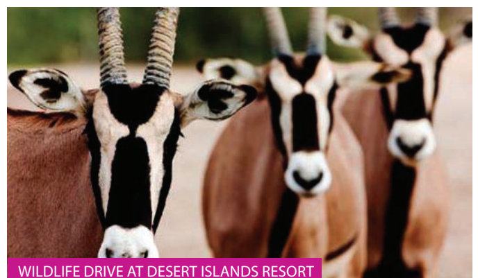
WILDLIFE DRIVE AT DESERT ISLANDS RESORT

Minimum stays and blackout periods may apply. Supplements may apply during trade fairs, special events and Easter. Booking fee may apply. Additional hotel rates are available upon request.